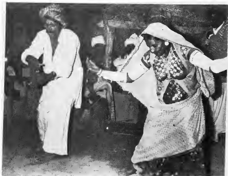
Jhoomer, a wedding dance