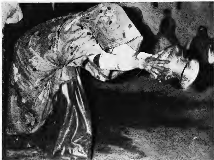
Chori, a wedding dance