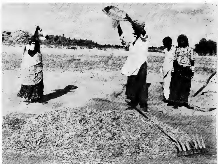
A Kolhi farmer family at work