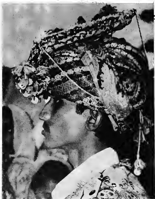
A Kolhi bridegroom