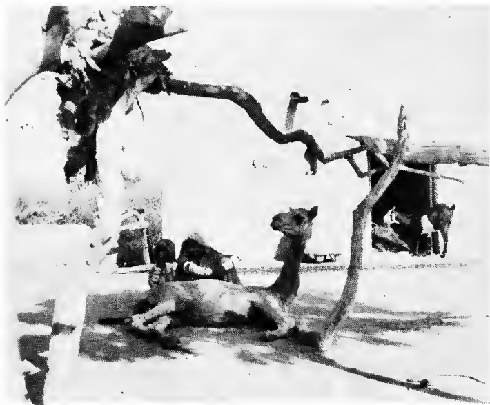
A Kolhi mother and child with their camel