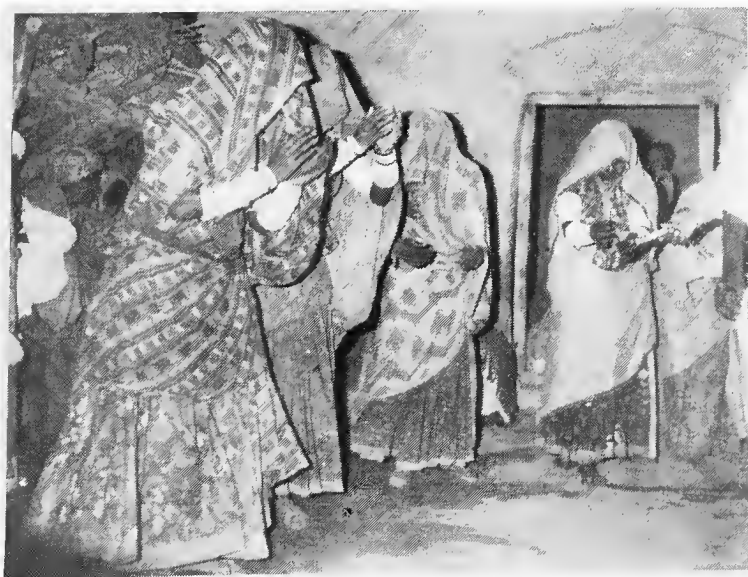
Song and dance